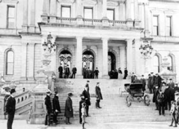
Olds on Capitol Steps