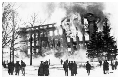
Olds Hall – MSU, 1916