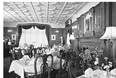
English Inn Dining Room

Home of the Lugnuts, who are a Class A minor baseball team affiliated with the Chicago Cubs. Stadium holds 10,000. It's a reminder of how important Oldsmobile was to the city through the park's name, the team name and the mascot (Lugnuts and Ratchet). Park provides venue for cultural events.