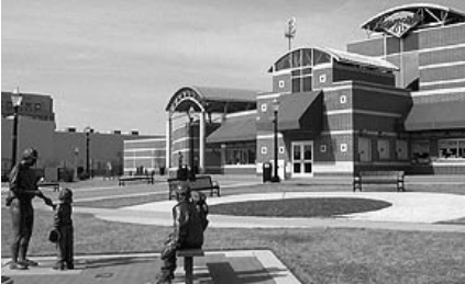
Olds Park – Home of the Lansing Lugnuts