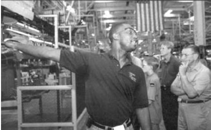
Lansing Car Assembly Tour