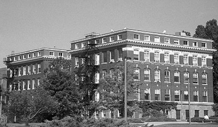
Olds Engineering Hall – MSU (Today)

Conrad Hall, MSU, East Lansing, Ingham County R.E. Olds personal papers are housed in the University Archives.