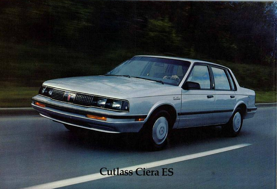
Cutlass Ciera ES