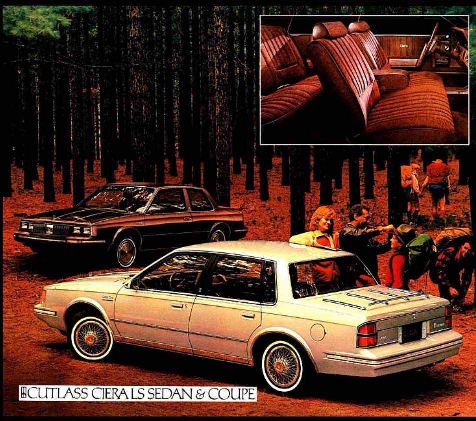
THE CUTLASS CIERA LS SEDAN & COUPE