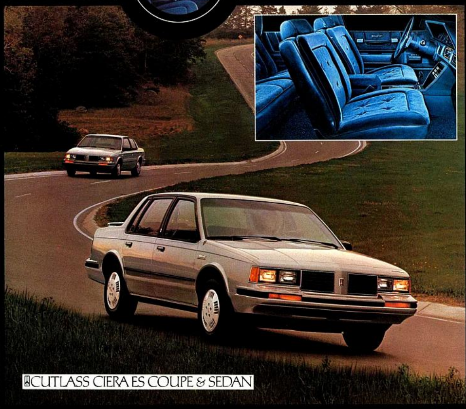
CUTLASS CIERA ES COUPE & SEDAN

The style, luxury and individuality you've been looking for—all under one very special roof.