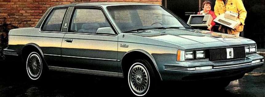
THE CUTLASS CIERA BROUGHAM COUPE

Take to the road, and the feeling of Cutlass heritage becomes even more apparent. The ride is Cutlass smooth and Cutlass quiet.