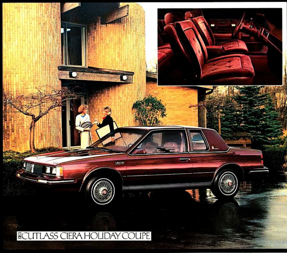
CUTLASS CIERA HOLIDAY COUPE