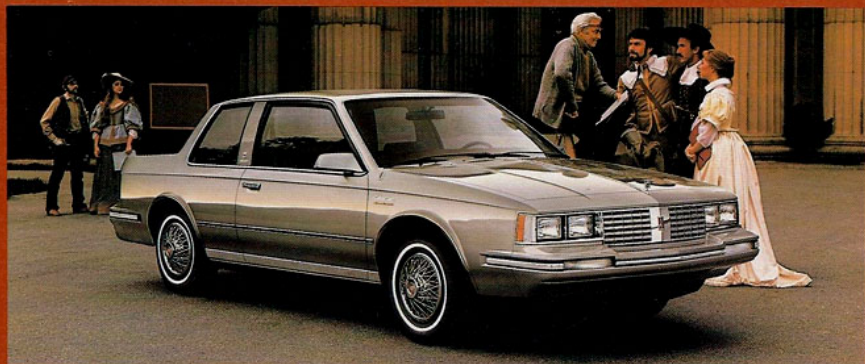
Cutlass Ciera Brougham Coupe.