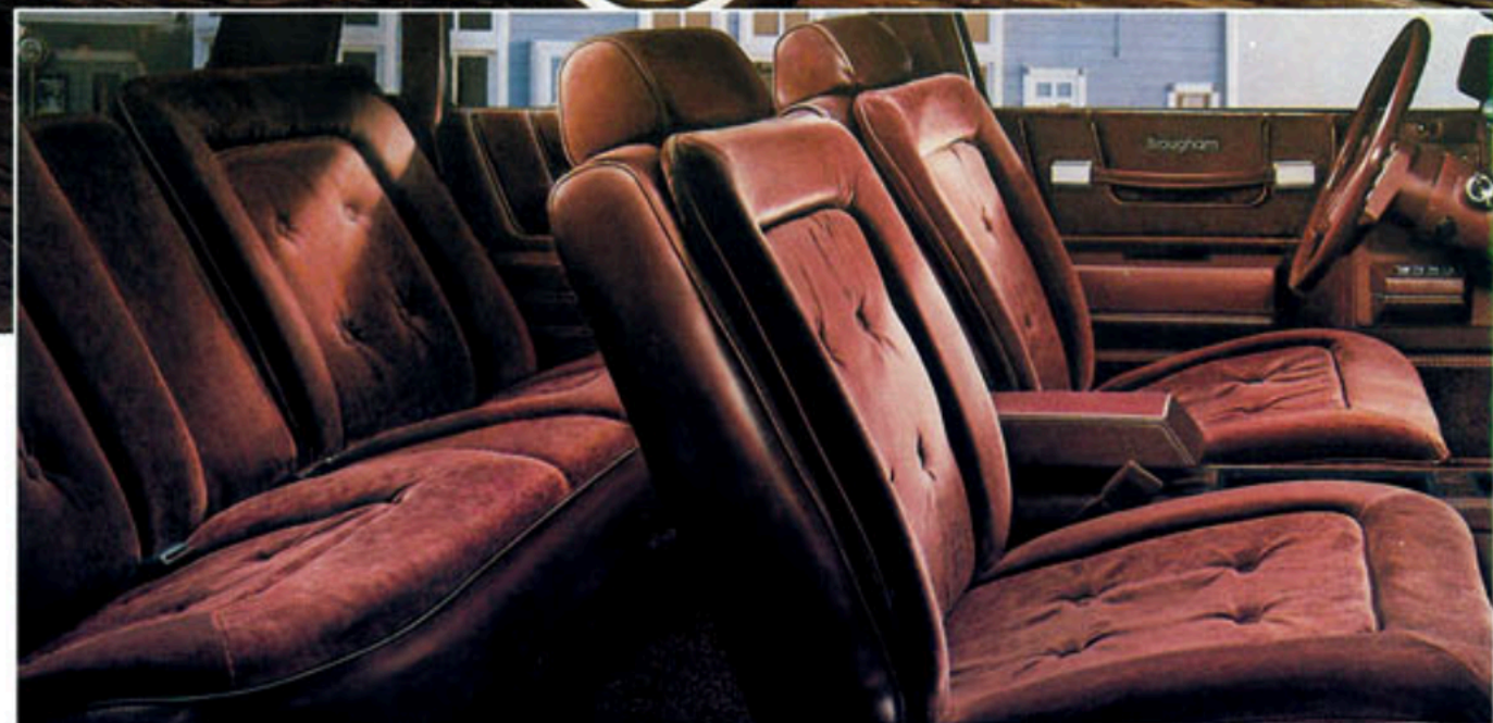
Cutlass Ciera Brougham Sedan.

Brougham luxury in the first front-wheel drive Cutlass. At Oldsmobile, we believe that a front-wheel drive car should do a lot more than hold the road. It should hold your attention.