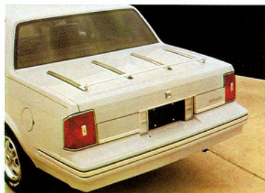
Available deck-lid carrier for extra luggage