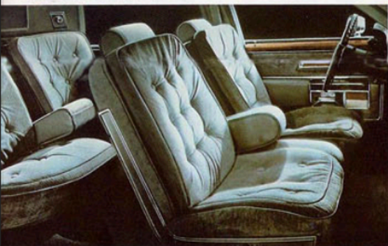
Ninety-Eight Regency standard interior.