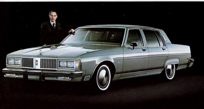
Ninety-Eight Regency Sedan.