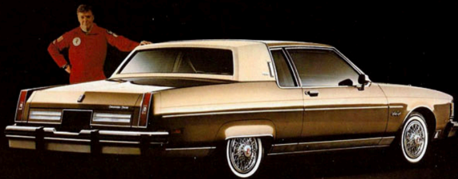
Ninety-Eight Regency Coupe.

Logic and luxury. In a Ninety-Eight Regency, you get the best of both.