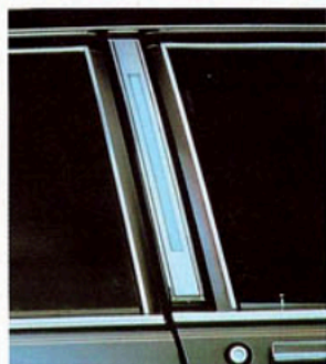
Opera lamps, a distinguishing note for Regency Brougham.