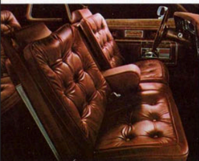
Genuine leather available in the seating areas.