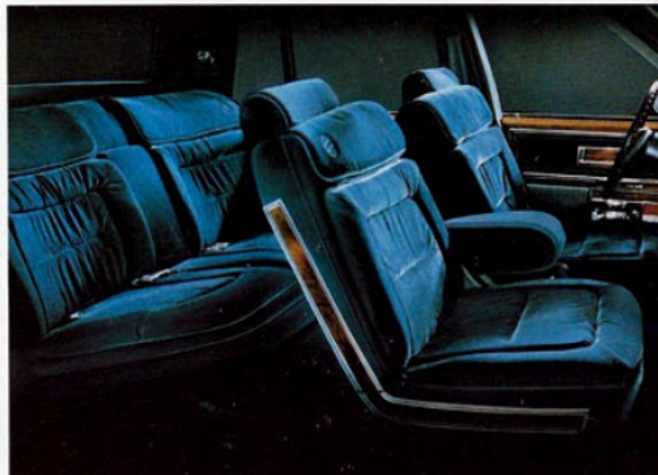
Ninety-Eight Regency Brougham Sedan standard interior.