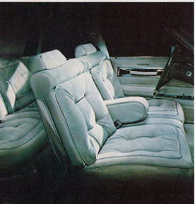
Cutlass Supreme Brougham standard interior.