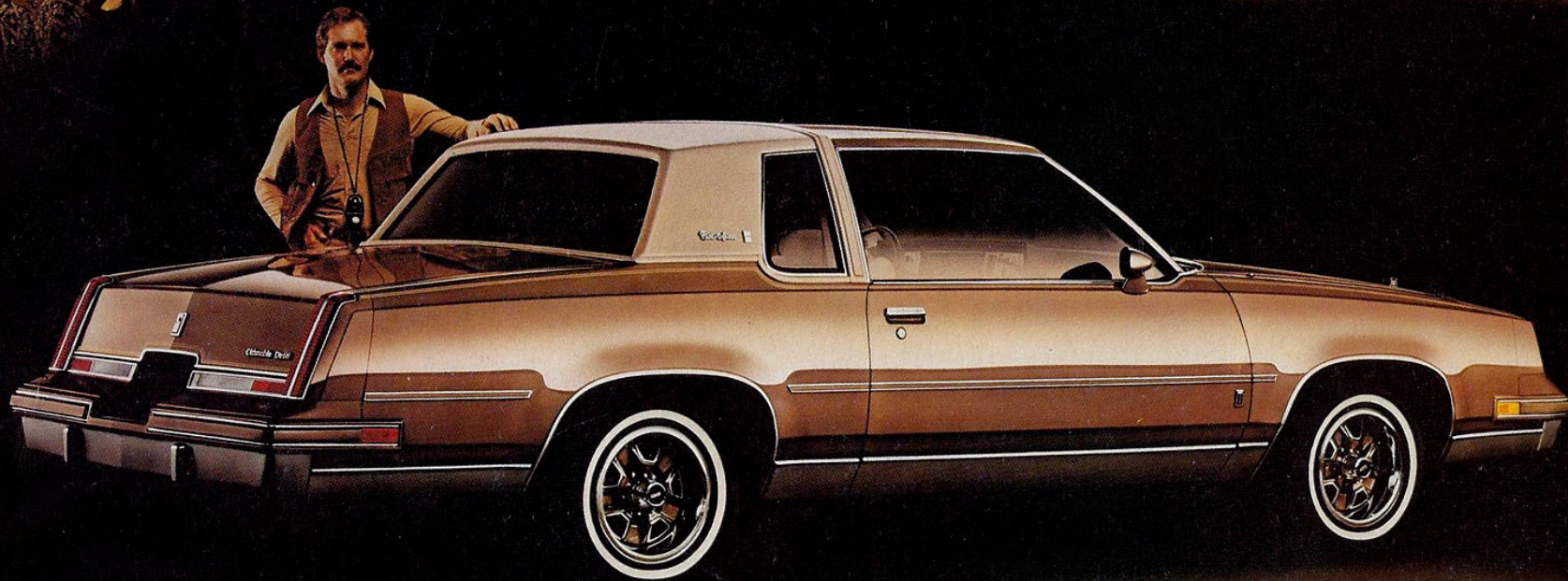
Cutlass Supreme Brougham Coupe.