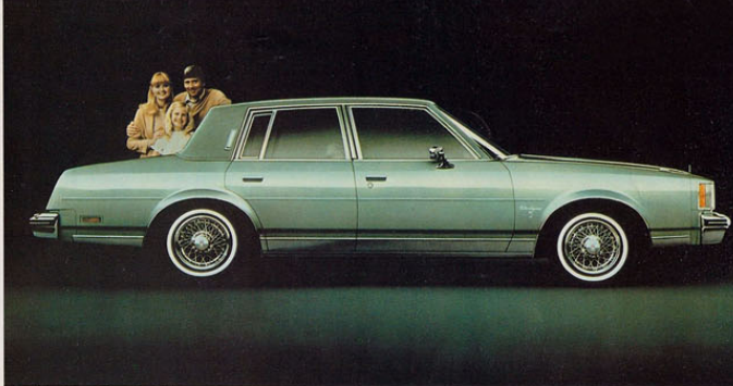
Cutlass Supreme Brougham Sedan.

Cutlass Supreme the practical, yet elegant total-value with a classic look. Take a good look at each of the new Cutlass Supreme models. Take a test drive—in the one that's right for you.