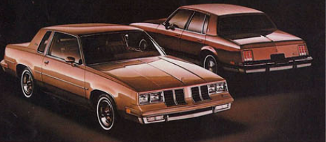
Cutlass Supreme Coupe (foreground) and Sedan.