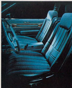
Cutlass Calais standard interior.