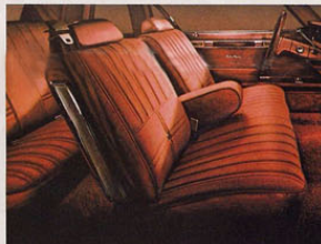
Cutlass Supreme standard interior.