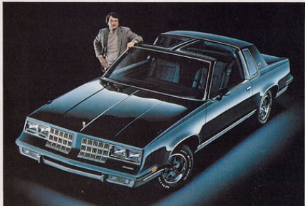
Cutlass Calais Coupe.